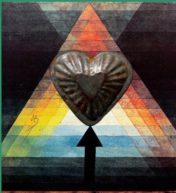
VARUJAN BOGHOSIAN, Eros Heart , mixed media construction, 10.25 x 7.50 in, 21 x 17" framed